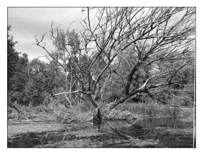
Figure 4. The one of natural places in Angrapa River middle reaches (near shoreline water vegetation)

In Angrapa many substrates were not inhabited by mollusks. The majority of gastropods ( Th. fluviatilis, B. tentaculata, R. auricularia ) had lived on the stones of the shallow river banks. These snails are lithoreophilous. B. tentaculata formed settlements on anthropogenic objects. R. auricularia located on the stems of aquatic plants at the shore line. V. viviparus were found on overgrown, covered with silt substrates: stones, shallow boulder banks, on silted boulders, on dam metal and concrete. A. fluviatilis , sometimes, were found on empty shells of bivalve molluscs.