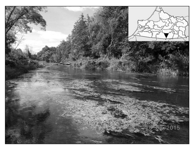
Figure 1. In the middle reaches of the Angrapa River (The map of site location in the Kaliningrad Region)

containing shells of died molluscs were found, i.e. they were the sampling sites for thanatocoenoses. After the identification of mollusc species immediately in field, the live mollusks were restored to the river. We selected some of specimens for photographing. For identification in the field, an identification key of the mollusks of Germany was used [3]. Some specimens of alive molluscs and samples from the thanatocoenoses were identified in the laboratory [4, 5, 6]. Generic and species names are given according to [7] and [8].