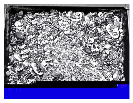
Figure 3. Thanatocoenosis of the Angerap River near the Veselovka village, spring of 2009

Shells of 26 species (18 - gastropods, 8 - bivalves) were found in the thanatocoenosis of the Angrapa River (Table 1). Species that were typical only for thanatocoenosis: Valvata piscinalis (Müller, 1774), Valvata cristata Müller, 1774, Potamopyrgus antipodarum (Gray, 1843), Galba truncatula (Müller, 1774), Bathyomphalus contortus (L., 1758), Anisus vorticulus (Troschel, 1834), Anisus leucostoma (Millet, 1813), Gyraulus albus (Müller, 1774), Gyraulus crista (L., 1758) and Dreissena polymorpha (Pallas, 1771). Here it should be noted that the samples taken in 2015 were no so rich comparing with these sampled in 2009 (Figure 3). This allows us to conclude that the results (2015) obtained here are preliminary.